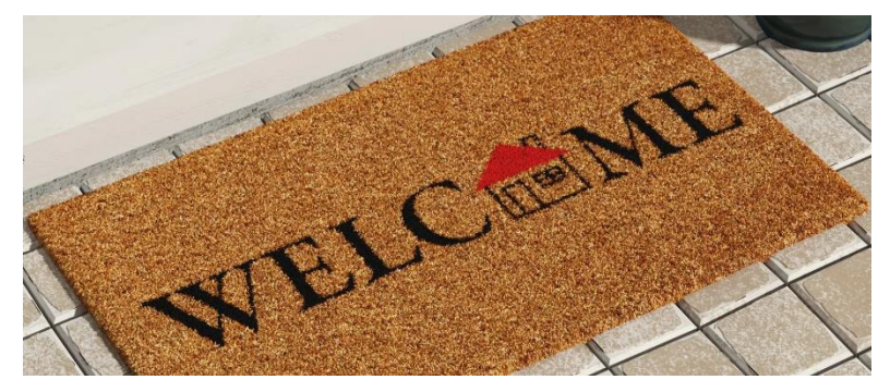
13<sup>th</sup> Sunday in Ordinary Time Year A 28 June 2020