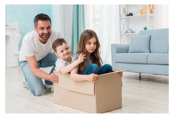
Images from Unsplash.com, Freepik.com and Pixabay.com. Used under licence/with permission. Contemporary English Version of Scripture extracts provided under licence from ICEL to Liturgy Brisbane.

You will need ribbon or string, a small and a large rock (or small and large book). Using the ribbon or string tie the right wrist of one person to the left wrist of another person. Do not make it tight. "Ok, now that you are tied together, let's see what you can do. Try waving together. Now try clapping! Try writing in the air (or have a pen and paper for them to try). Can you pick up this rock together? (Have a small rock and a large rock; see which one is easier to pick up) "What is it like being yoked together? What is hard about it? What is fun about it?" Make sure everyone in the family has a go.